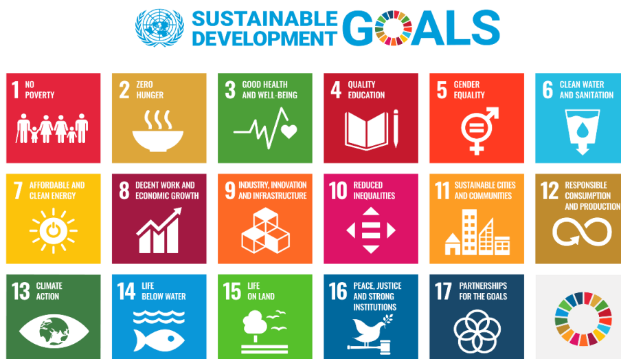
Figure 2: 17 UN SDGs

In addition, a special consideration of sustainability (WP6) will be ensured as replication drivers, and impacts related monitoring and reporting, where, for instance, reference and contribution to UN SDGs (United Nation Sustainable Development Goals, figure 2 ) will be included to the extent in which it makes sense for the project and the subsequent work carried out.